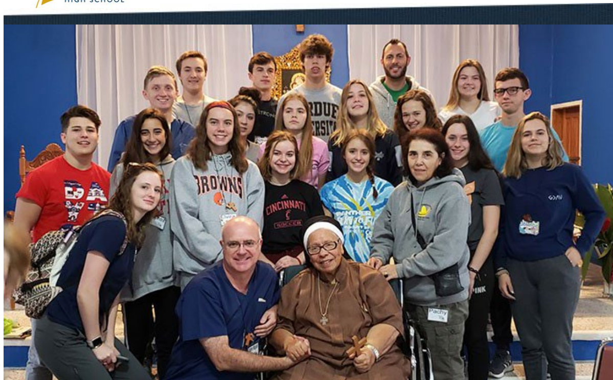
Honduras Medical Mission